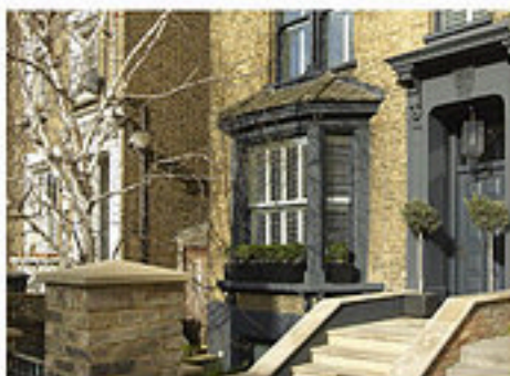
The exterior RICHARD POWERS

connecting with the bathroom, which is dominated by a working fireplace and a cocoon tub. The top floor has two guest bedrooms and a bathroom.