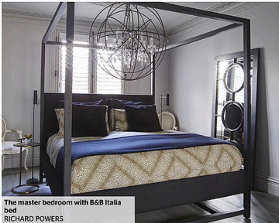
The master bedroom with B&B Italia bed RICHARD POWERS

Upstairs, Botelho reconfigured the first floor as a huge master suite, with light flowing in from the windows at either end. The space can be divided with recessed sliding glass doors, if needed, although essentially it's an open-plan room with the sleeping area