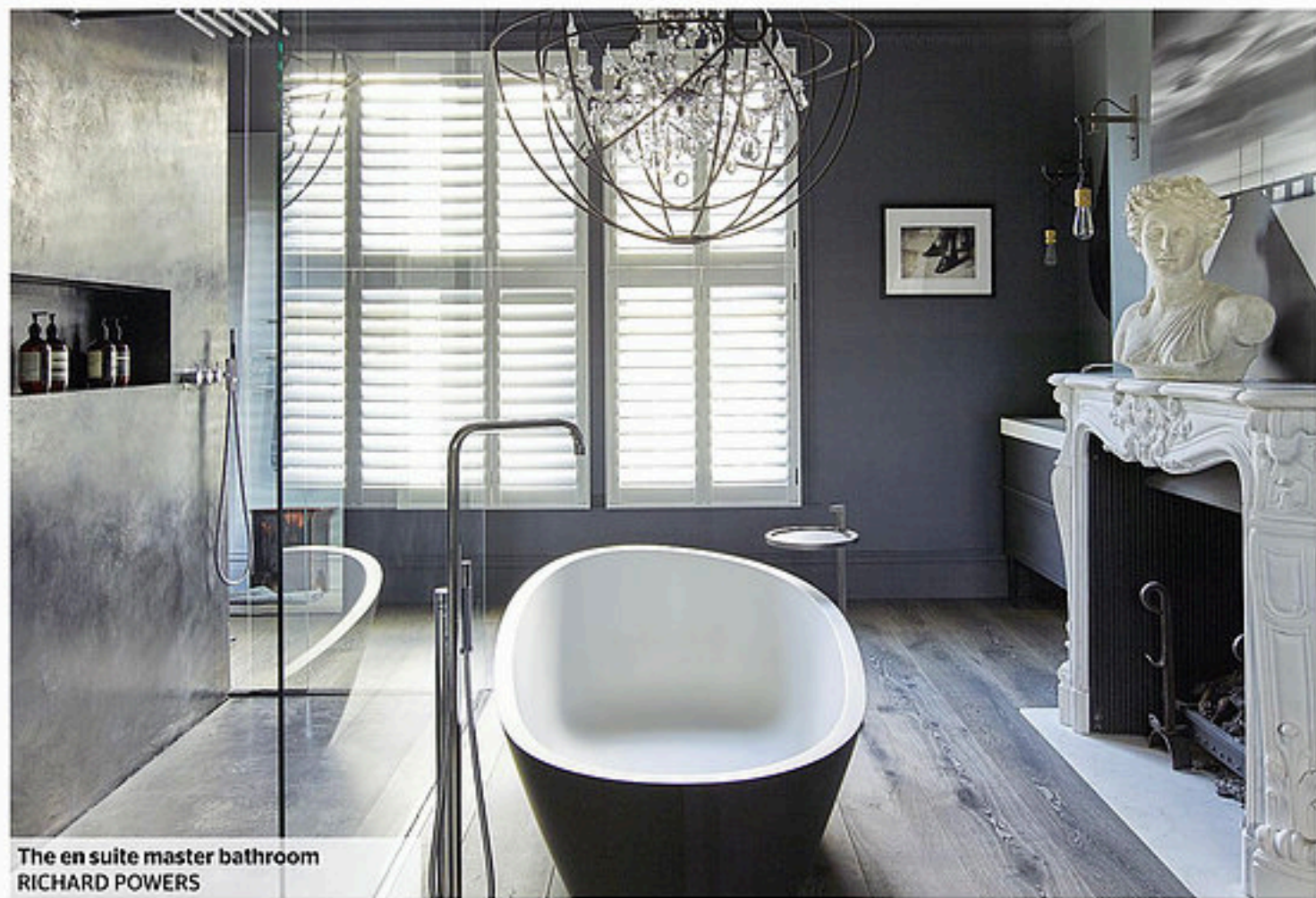
The en suite master bathroom